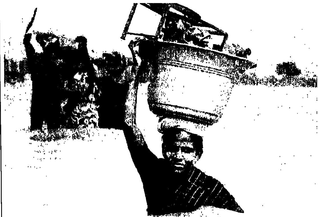
A woman wades through flood water in the outskirts of India's southern city of Madras. Thousands of homes were submerged during heavy rains in Tamil Nadu which have claimed more than 80 lives.